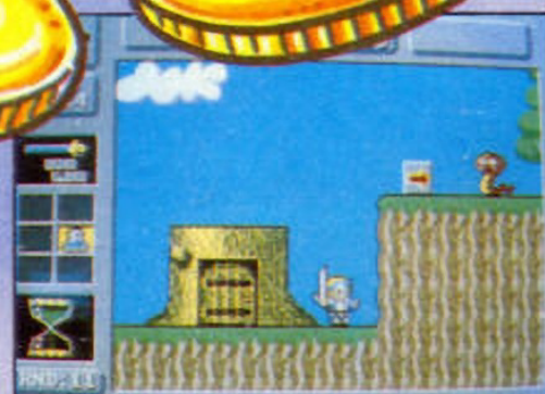
ATARI ST SCREENS SHOTS SHOWN